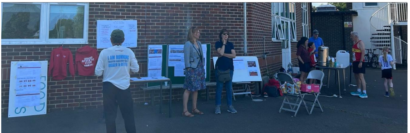
Above: Some of the great Lewes AC supporters