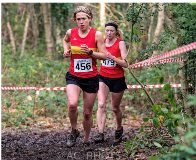
Team event 1 st (4 runners count) 50 competitors