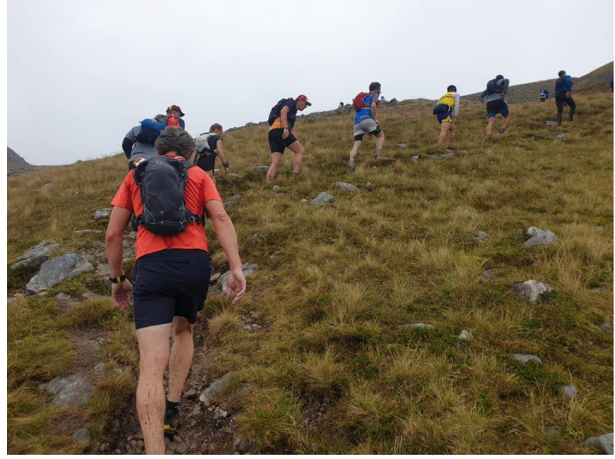
<Back to Contents>