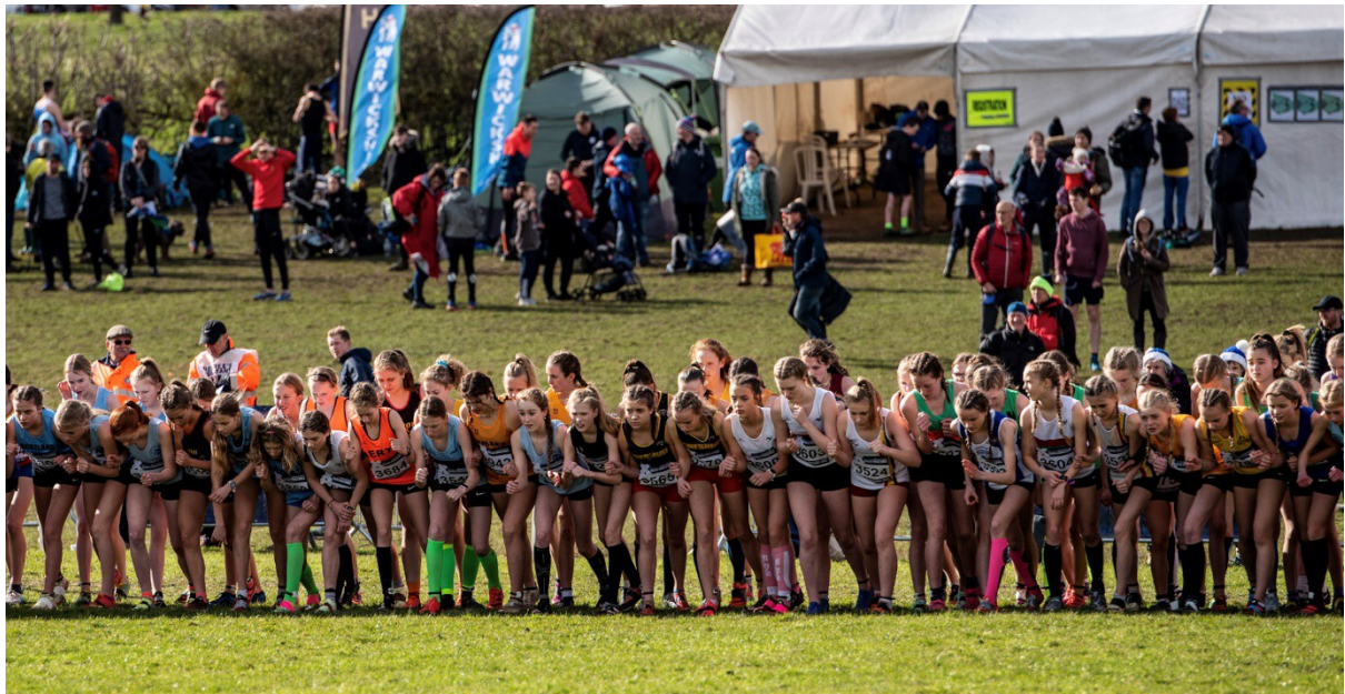
Above: U15 Girls 4km Start