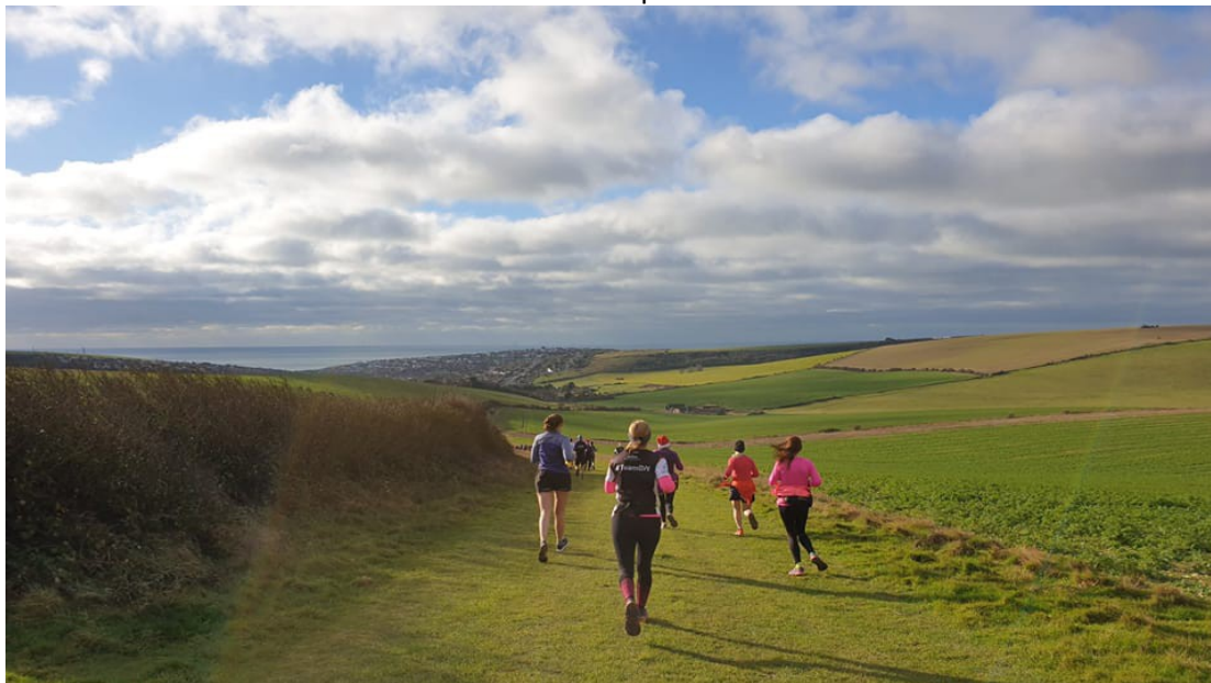
Fast downhill segment into Saltdean

All the above were awarded an individual mince pie after the race.