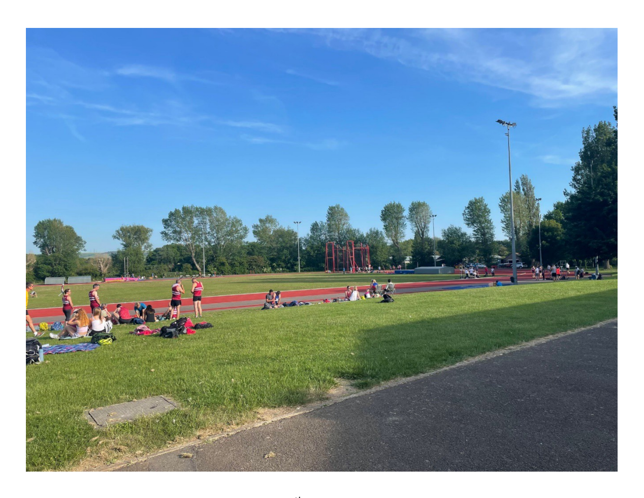
Above: The Field of Dreams: Monday 14<sup>th</sup> June 2021 Lewes Athletics Track.